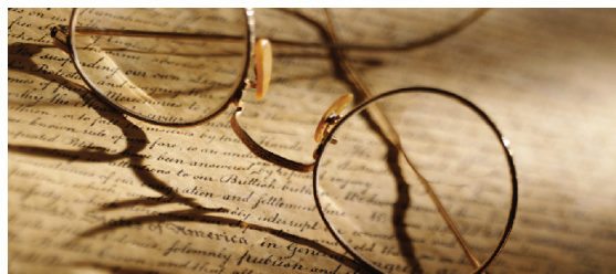
The Church Library at GBC

SF Men's Prayer Meeting: 12:00 pm Cal Grace.: 7:00 pm